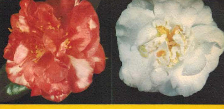
Pride of Houston